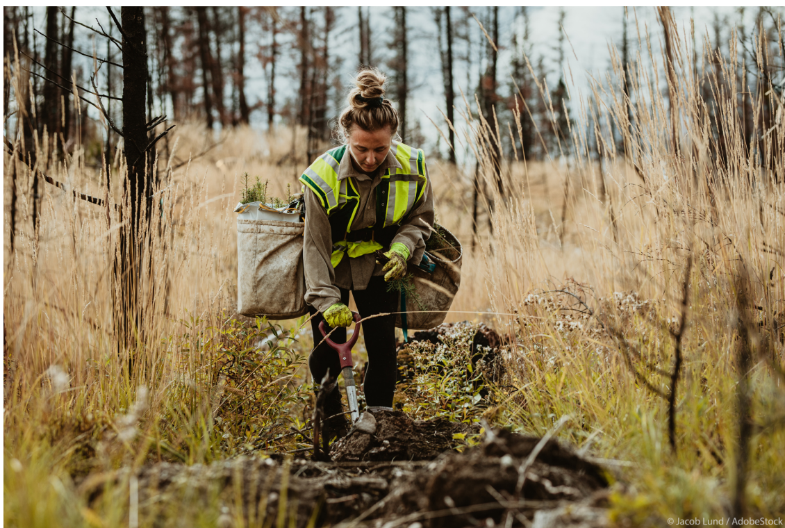
Nature restoration supports the recovery of damaged ecosystems and bring more nature and biodiversity back everywhere.